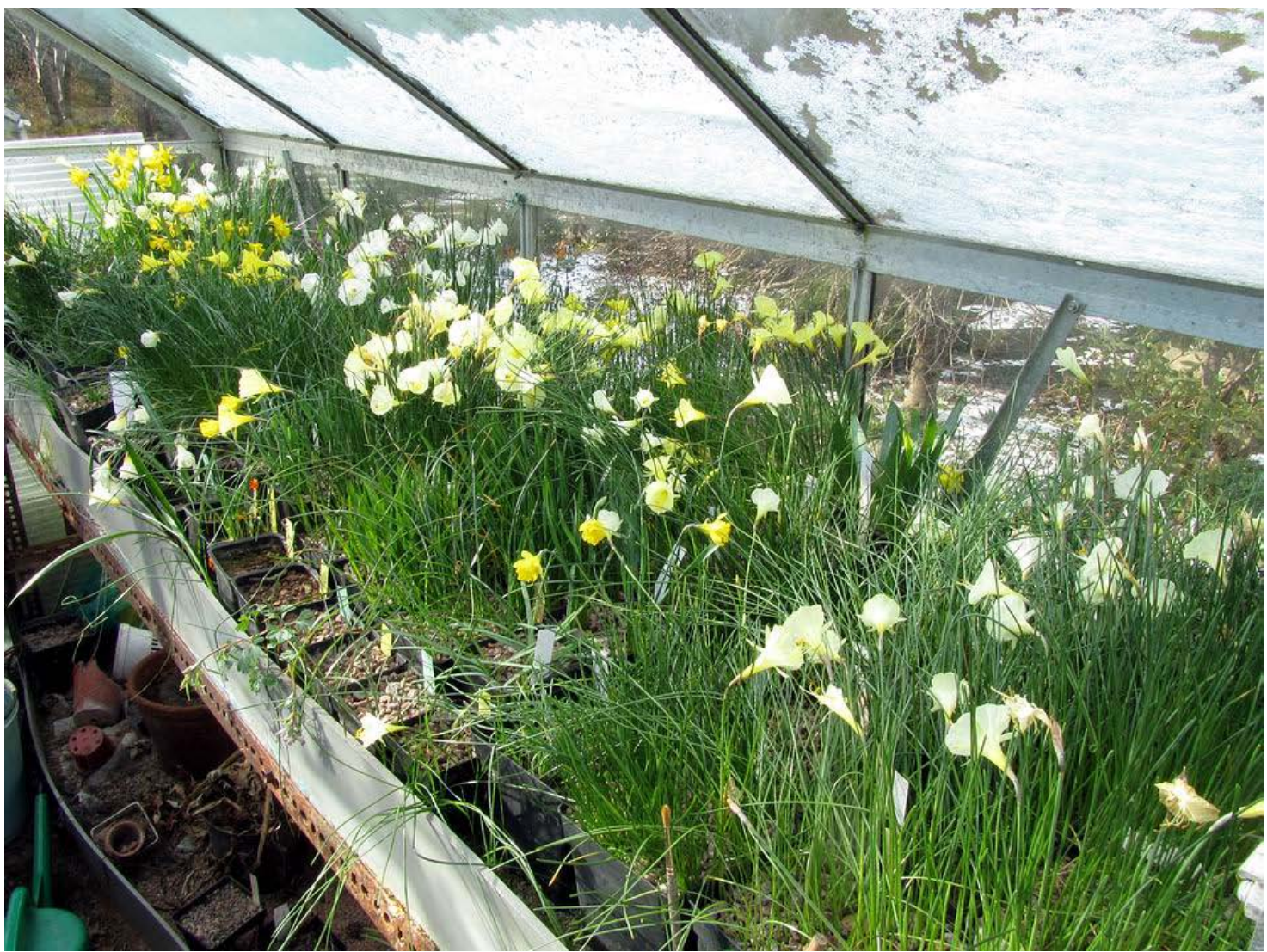
There are still plenty of Narcissus coming into flower in the bulb house giving us a wonderful display.