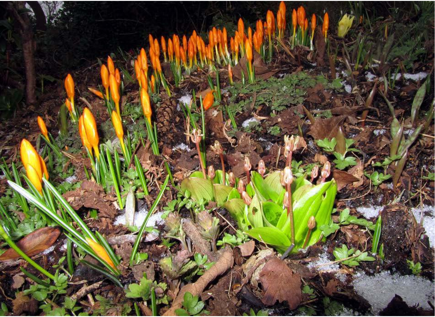
Illuminated with flash due to the low light is a wonderful display of hardy spring plants with Crocus herbertii and Scoliopus hallii – showing just how tough some of these plants are.

Many Narcissus flowers are now going starting to wither and I just hope that despite the cold that some of them will have been fertilised and will produce seed. Last year I got hardly any seed as the pollen rotted due to the cold damp weather at flowering time. While it has been colder this year it has not been so damp. I have not noticed any mould on the pollen so I remain hopeful of getting some seed.