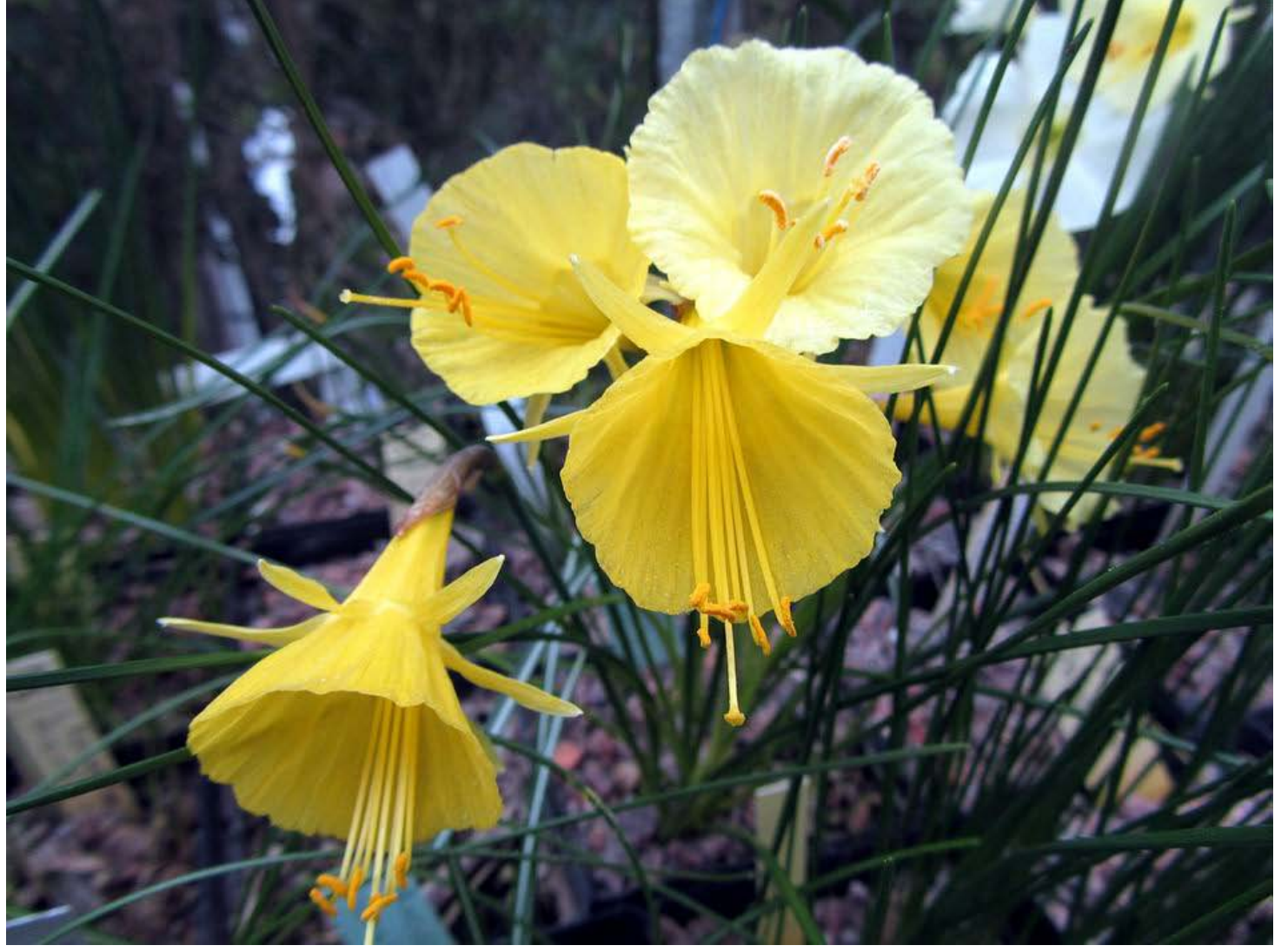
Different colour forms of Narcissus bulbocodium