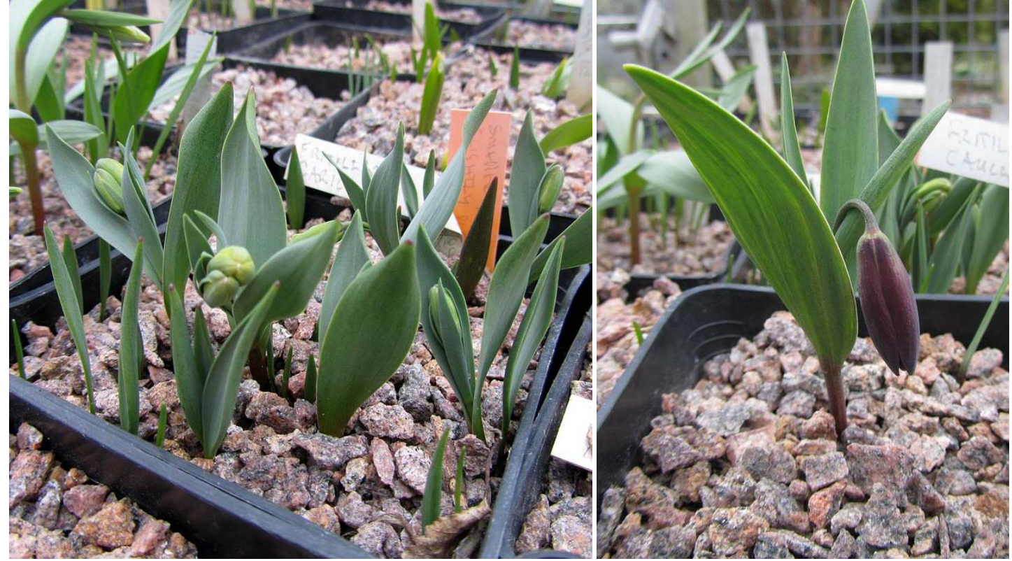
Fritillara carica and Fritillaria caucasica are among the many other species in bud.

Raising them from seed I selected this compact form which flowers on a relatively short stem making it ideal for growing in a pot – this made a fine exhibit and served us well during the days when we were showing regularly. I have a number of other forms that are taller, some have darker flowers, some have larger flowers. I also grow this species outside but as they come into growth early they are susceptible to being destroyed by frosts – for this reason I will always keep some under the protection of cold glass.