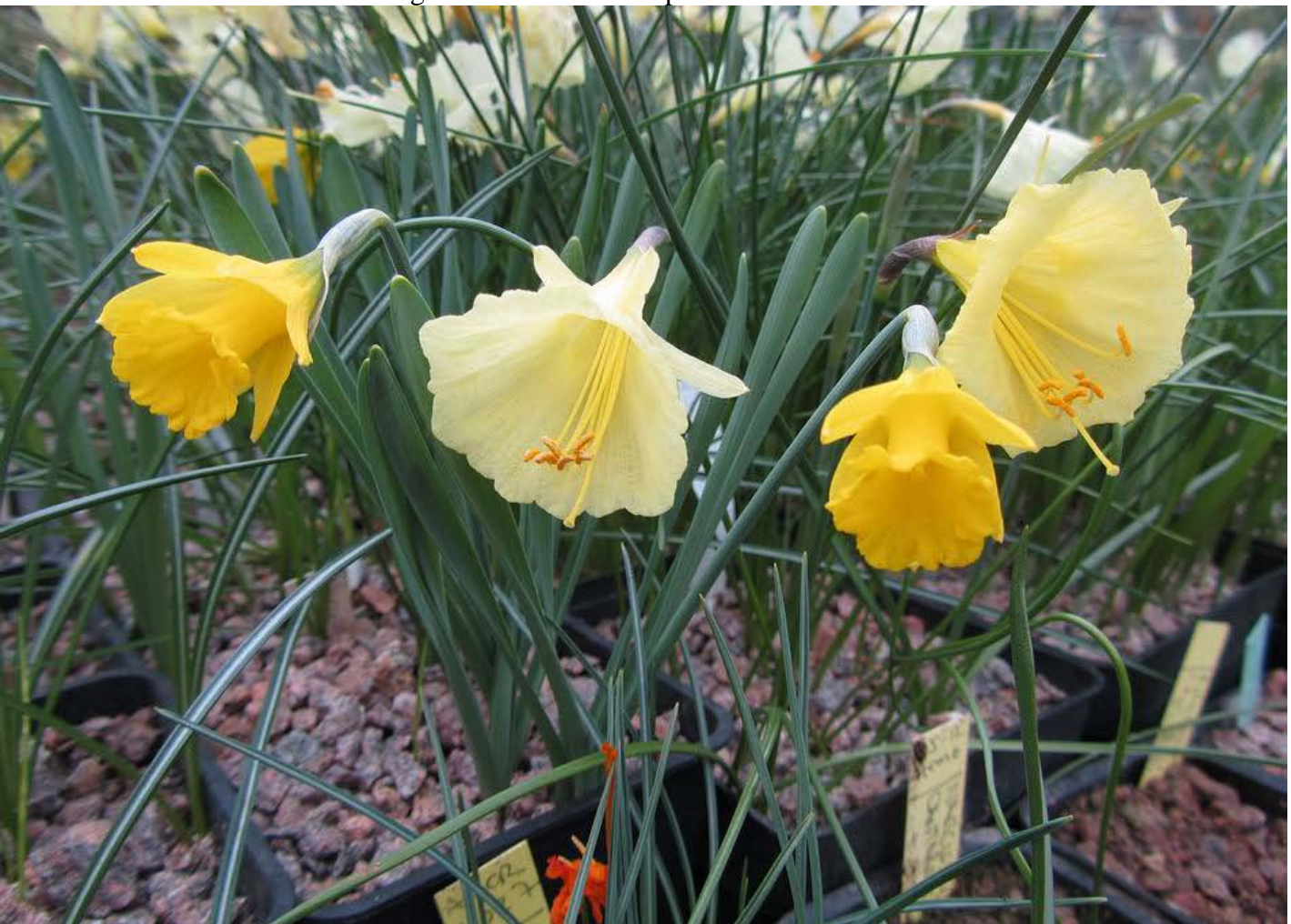
I much prefer seeing the range of flower shapes and colours displayed in these adjacent 7cm pots of Narcissus asturiensis and Narcissus bulbocodium.