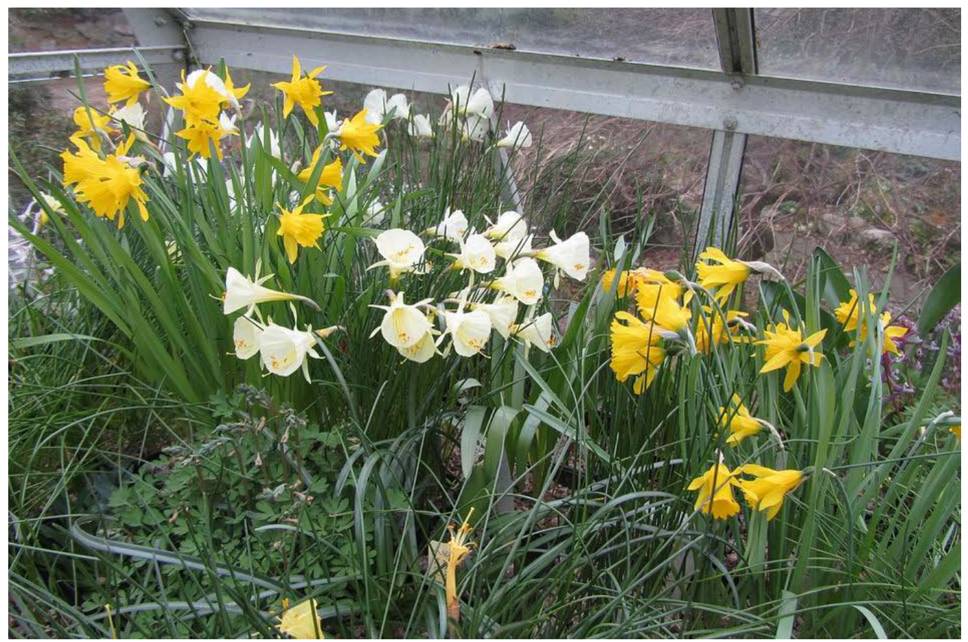
The colour here is provided by Narcissus perez-chiscanoi and Narcissus 'Craigton Bell'.