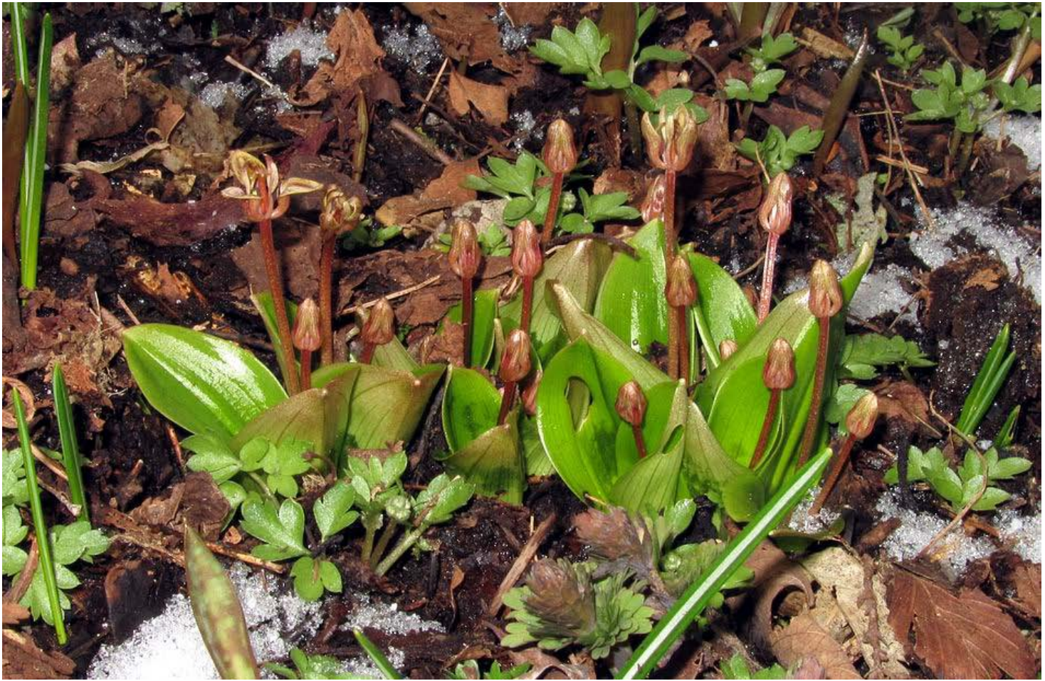
The flowers of Scoliopus hallii are just starting to open – I regularly get seed from this species and while I let some naturalise I do collect some to sow in pots as seen below.