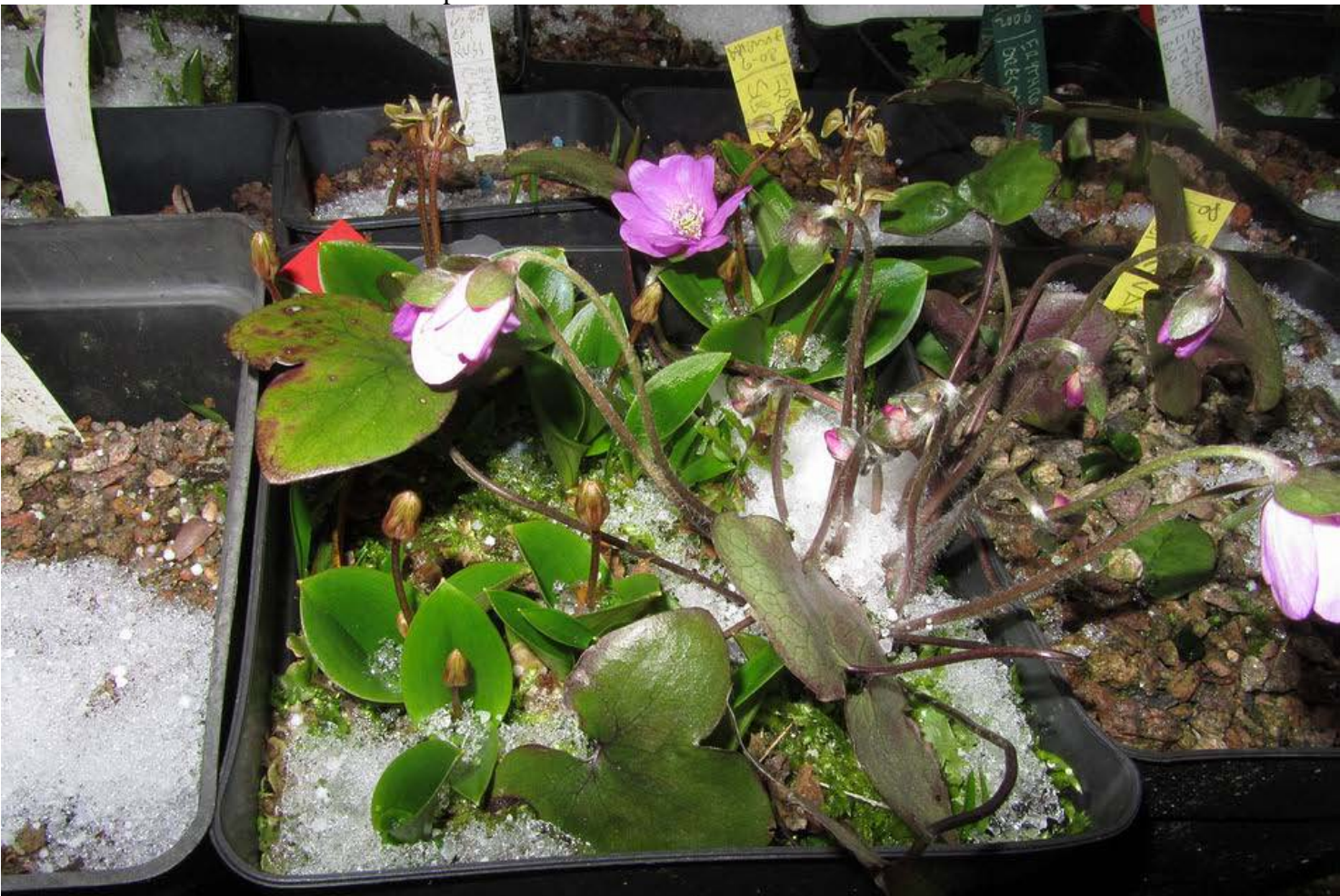
I sow the seeds into 11cm pots and leave them there until they reach flowering size when they can be planted out directly into the garden. By leaving them in a pot for a number of years self seeding contamination happens with a Hepatica seedling happily sharing this pot – I love it.....