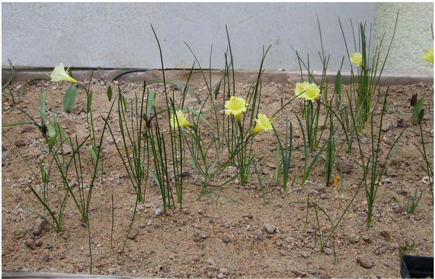
A view across the experimental sand bed where Narcissus are in flower now Fritillaria shoots are also appearing – I will add many more bulbs to this bed in the coming year.