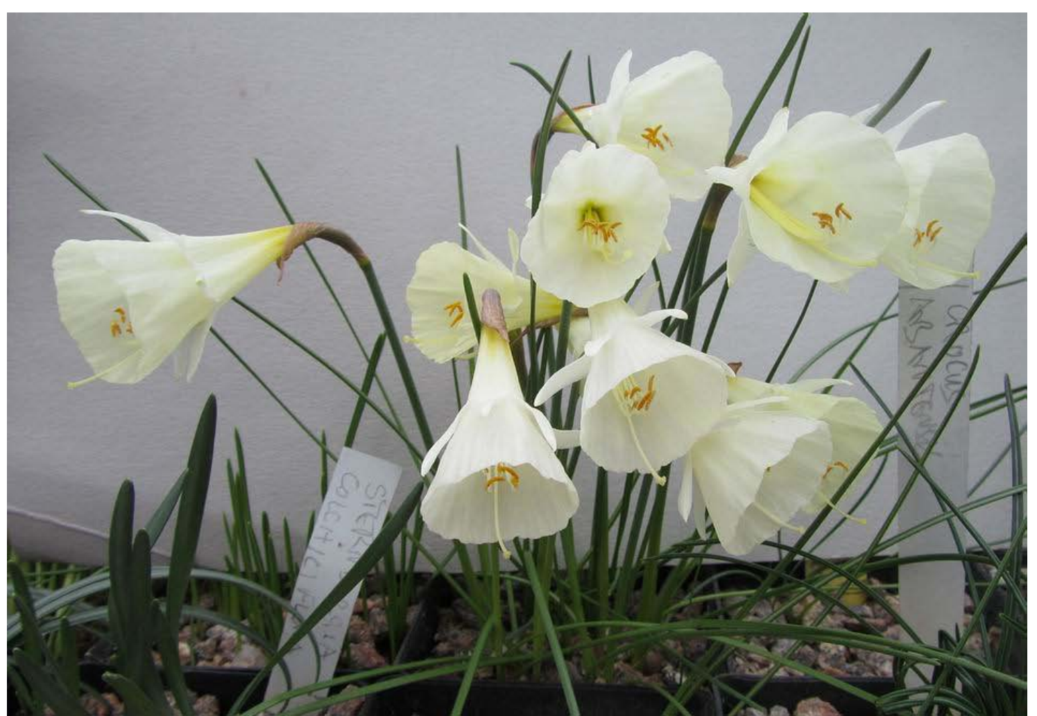
The single colour of a clonal pot of Narcissus 'Don Stead'.