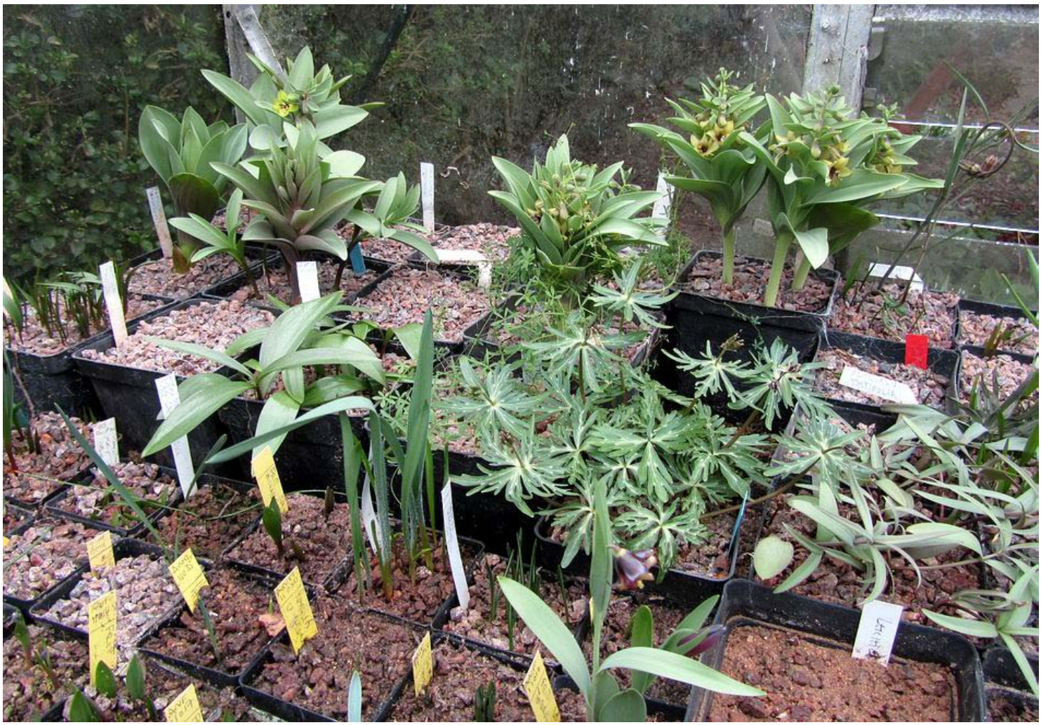
I group some of the larger species into one corner of the Frit-house and one of my favourite species is Fritillaria sewerzowii.